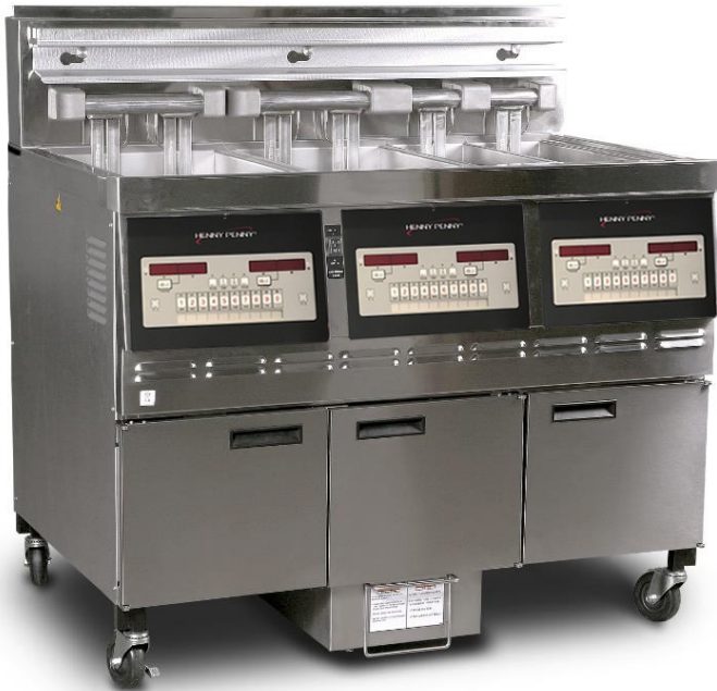
GVE 073 3-well manual low oil volume open fryer with two full vats and one split vat

GVE 071 1-well electric GVE 072 2-well electric GVE 073 3-well electric GVE 074 4-well electric