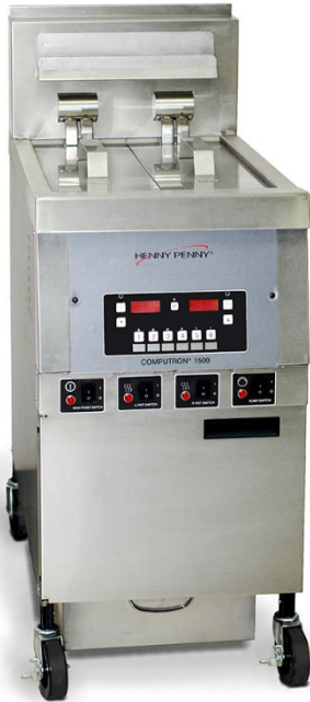
OFE 141 single well split vat electric open fryer with Computron™ 1500 control and optional built-in filtration

Henny Penny open fryers offer high-volume frying with simple programmable operation and fast, easy filtering with optional built-in filtration. The OFE 140 Series open fryers are available in full vat or split vat configuration. The split vat choice gives you the flexibility to fry smaller batches of different products in separate environments at the same time—a great way to multiply your profits with one fryer. Henny Penny open fryers recover temperature very quickly. Fast recovery translates into higher throughput, lower energy costs and longer frying oil life. Optional built-in filtration system quickly drains, filters and returns hot frying oil with no separate pumps or pans required. Frequent filtering