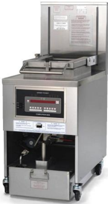
OFE 291 high volume electric open fryer

Henny Penny high volume open fryers offer tremendous throughput in a highly reliable frying platform with programmable operation, oil functions and fast, easy filtration.