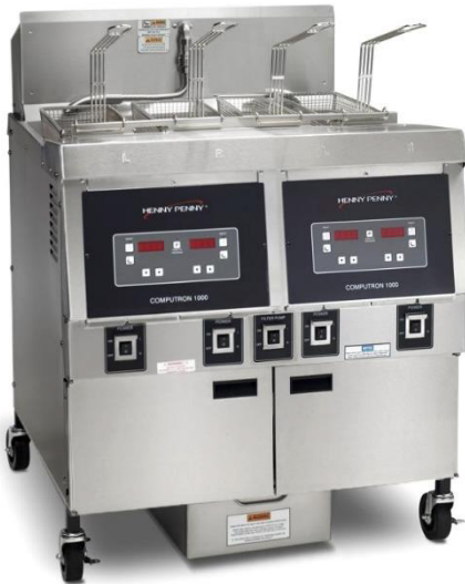
OFE 322 2-well electric open fryer with split vats and Computron™ 1000 control

OFE 321 1-well electric OFE 322 2-well electric OFE 323 3-well electric