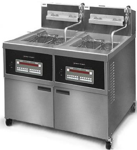
OFE 342 2-well large capacity electric open fryer with Computron™ 8000 control

OFE 341 1-well electric OFE 342 2-well electric