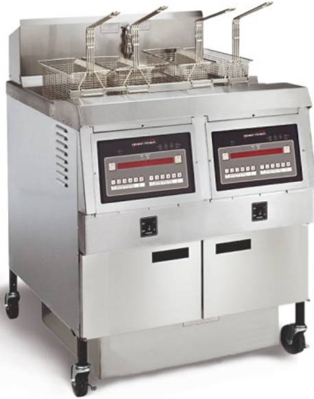
OFG 322 2-well gas open fryer with Computron™ 8000 control

Henny Penny open fryers offer high-volume, integral multi-well frying with programmable operation, oil management functions and fast, easy filtration.