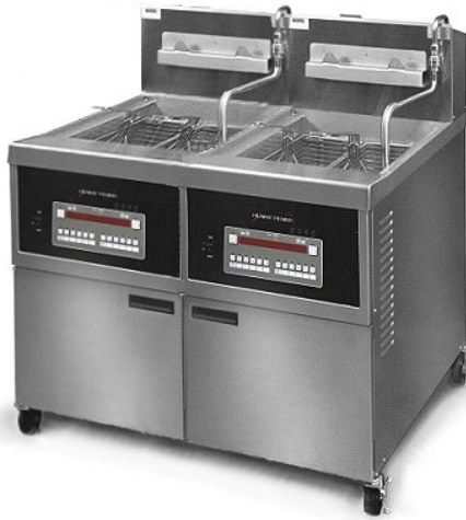
OFG 342 2-well large capacity gas open fryer with Computron™ 8000 control

Henny Penny open fryers offer high-volume frying with programmable operation, oil management functions and fast, easy filtration.