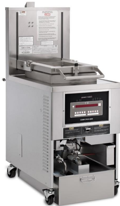
OFG 391 high volume gas open fryer

Henny Penny high volume open fryers offer tremendous throughput in a highly reliable frying platform with programmable operation, oil functions and fast, easy filtration.