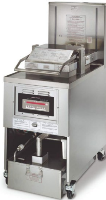
PFE 591 high volume electric pressure fryer

Henny Penny first introduced commercial pressure frying to the foodservice industry more than 50 years ago. Frying under pressure enables lower cooking temperatures for longer oil life and faster cooking times to meet peak demand. Pressure also seals in food's natural juices and reduces the amount of oil absorbed into product.