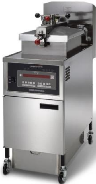
PFG 600 gas pressure fryer with Computron™ 8000 control

Henny Penny first introduced commercial pressure frying to the foodservice industry more than 50 years ago. Frying under pressure enables lower cooking temperatures for longer oil life, and faster cooking times to meet peak demand. Pressure also seals in food's natural juices and reduces the amount of oil absorbed into product.