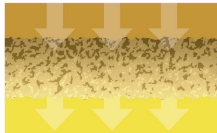
Prime Filter envelopes traps particulate AND adsorbs dissolved impurities for cleaner, fresher, longer-lasting oil.